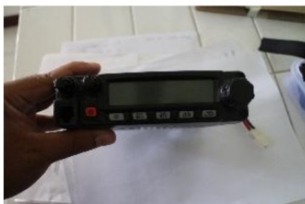
Figure 4 Radio receiver Yaesu FT-1802 M/E

The next step was to coordinate the member of team researchers, also with LIPI and RCS (Raptor Conservation Society) to conduct stabilization team through theoretical training and simulation in the Semarang state University area (Figure 5), mangkang Zoo, and then directly in the field study.