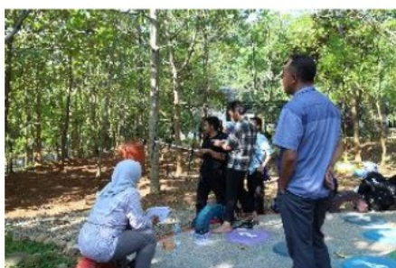
Figure 5 Simulation radio transmitter in SSU

The next step was to coordinate the member of team researchers, also with LIPI and RCS (Raptor Conservation Society) to conduct stabilization team through theoretical training and simulation in the Semarang state University area (Figure 5), mangkang Zoo, and then directly in the field study.