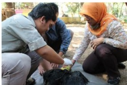
Figure 5 To setting radio transmitter on backpack

Trial installation of the transmitter have been done on Wreathed Hornbill specimens in Mangkang Zoo. The transmitter placed in the backpack of the bird for one week (Figure 6 and 7).