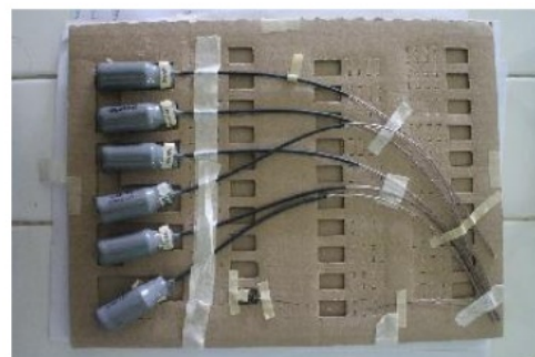
Figure 2 R1-2C transmitter models by HSL with the different number

The antennas type that we used also Whip type, while receivers are used Yaetsu mkl1 the FT 690 mhz frequency 150000-151999 (Figure 3 and 4).