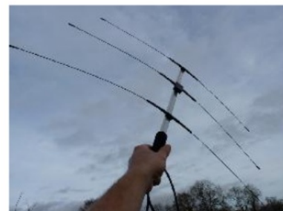
Figure 3 Antenna Yagi 151 MHz

The antennas type that we used also Whip type, while receivers are used Yaetsu mkl1 the FT 690 mhz frequency 150000-151999 (Figure 3 and 4).