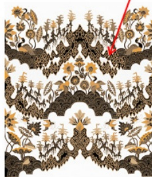
Figure. 4 Batik Motive of "Motif Batik Taman Telaga Teratai"