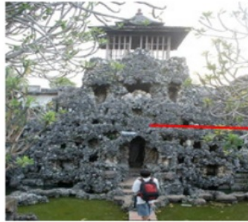
Figure. 2 Swiyaragi Lansecap keraton artifact