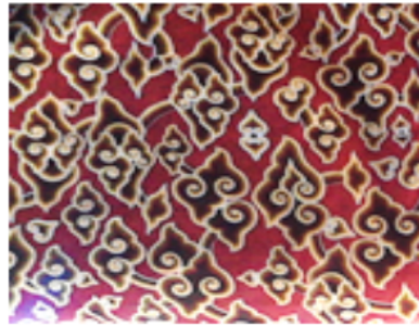
Figure. 1 Classical Wadasan motive

Wadasan is developed variously through different motives style in which Wadasan is not longer to be the main ornament in the motives. Wadasan has been transformed to function as a complementary ornament in the motive. It is characterized by additional ornaments showing some objects of Keraton and its surrounding. Such ornaments found are Gapura (Keraton Gate), Lotus Park (Taman Teratai), and Kereta Kencana Singabarong used as the symbols of palace belongings (Irianto, 2009). According to the craftsmen stated in the interview, each ornament in the motive gets different meanings particularly philosophical meaning related to the power of Keraton as an authority person in his government. For example, an ornament of Kereta Kencana Singabarong is representing a riding car mounts Sunan Gunung Jati in preaching throughout the island of Java. Variety of three-dimensional ornaments on the Train is a motive Wadasan composed by craftsmen and Ayam Alas motive consists of three ornaments (Wadasan as the main motive, supporting motives and isen-isen motives (the fillers). The main motive: the main motive is the Ayam Alas, flora and fauna as the supporting, and also the origin of the Wadasan shape found on the head, wings, feet and tail. Another motive is Wadasan and Kereta Singo Barong . Wadasan is functioned to support and add aesthetic value of the main motive, Motif Batik Taman Telaga Teratai. This batik motive can be seen in the following three pictures.