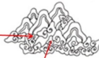
Figure. 3 Wadasan stone stilation originally inspired from keraton artifact