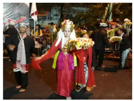
Fig 1. Seblang Bakungan Ritual (Source: Personal Collection, 2017)

The Seblang Bakungan ritual is started with "ider bumi", a ritual done by walking around the village on four cardinal directions or usually called "puju desa". In each of the "puju desa", there is a "site" that is believed to be the location where the ancestors live or where the "water sources" exist. After the "ider bumi", the dancer will head to the studio or stage while she is dancing the 12 songs performed as a parody or story. After completing the songs, the dancer ends the performance in front of the studio. She is then flanked by the handler and the shaman on the right and the left side respectively in order to cast some spells.