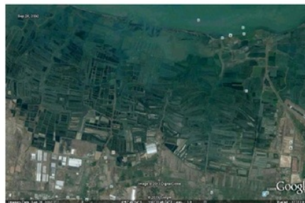
Figure 1. Map of the research site, the mangrove ecosystem in Tapak Area, Tugurejo Village, Semarang City

The research was conducted in Tapak Area, Tugurejo Village, Semarang City. The samples were taken purposively, based on the pond distribution from the land to the sea. Primary and secondary data were collected in the first year of the research. The primary data consisted of climate data (i.e. temperature, pH, salinity), and Cu heavy metal concentration in the water and the sediment of milkfish ponds, as well as in the roots and the leaves of A. marina . The secondary data consisted of regional climate data; rainfall. The equipment used in the research were thermometer, refractometer, DO meter, pH meter. Meanwhile, AAS device was used to analyze the heavy metal concentration in the water, sediment, and mangrove plants.