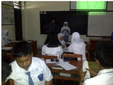
Fig. 1: Application of TPS based Mouse Mischief to solve mathematical problems.

Based on the CAR activity, the research results were as follows. (1) The application of TPS based on the use of the program of Mouse Mischief tested through CAR, could improve the ability to solve mathematical problems for high school students. (2) The application of TPS based on the use of the program of Mouse Mischief could improve SHS students in learning activities.