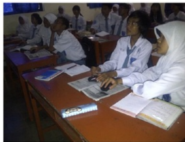
Fig. 2: Each student holds Mouse as a form of activity use the program of Mouse Mischief .