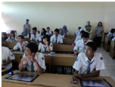
Fig. 3: Learning by applying TPS based on e-learning was begun.

Furthermore, after all the infrastructure and facilities are met, teachers and students are ready to implement 6 learning based on e-learning, then the implementation of mathematics learning through the implementation of TPS based on e-learning can be begun.