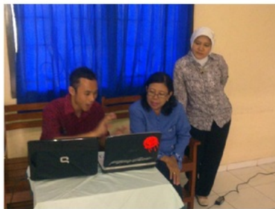
Fig. 1: Teacher partner was trained e-learning.