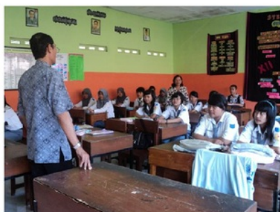
Fig. 2: Students were given an explanation of learning mathematics was taught through the application of TPS based on e-learning

Furthermore, after all the infrastructure and facilities are met, teachers and students are ready to implement 6 learning based on e-learning, then the implementation of mathematics learning through the implementation of TPS based on e-learning can be begun.