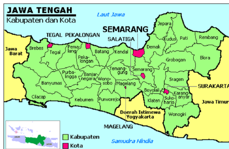
Figure 1. The six cities/towns and 29 districts of Central Java Province, Indonesia

The study was carried out during Mei - September 2016 in two towns of Central Java Province, Indonesia, namely Salatiga and Tegal (Figure 1). The town of Salatiga is located approximately at 7^{\circ}.17' - 7^{\circ}.27' S latitude and 110^{\circ}.27' - 110^{\circ}.32' E longitude with an altitude of 750-825 m above sea level. This town covering about 56.78 km 2 area and a population density of 3,191 people.km -2 . Administratively Salatiga consists of four sub-districts ( kecamatan ), namely Argomulyo, Tingkir, Sidomukti, and Sidorejo, and 22 villages ( kelurahan ).