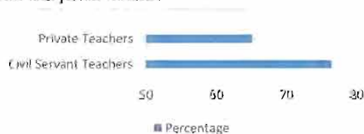
Figure 3 Teaching and Learning Process Based on Employment Status Curriculum Implementation in the Teaching Assessment

The implementation of the K-13 in English subject in terms of teacher employment status were as follows: teachers with civil servant status reached 76.46% of the achievement level in the teaching and learning process, while the teaching and learning process, which was not achieved, is 23.54%. Teachers with private employment status reached 70.86%, while the teaching and learning process, which was not achieved, is 29.14%. Although civil servant teachers and private teachers had implemented the 2013 curriculum in English subjects well, but teachers with civil servant status applied it better than private teachers.