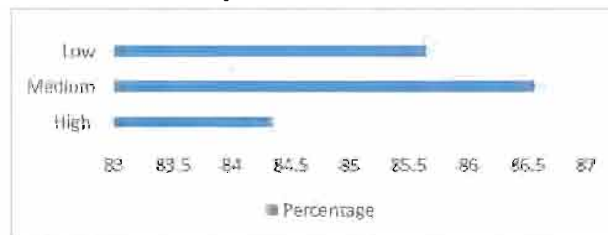
Figure 4 Teaching Assessment Based on National Examination Indexes

The assessment implementation of the K-13 in English subject for schools with low indexes of national examination was in good category where it reached 84.34%, while schools with medium indexes of national examination get 86.56%. Schools with high indexes of national examination got 85.65% in the assessment implementation of 2013 curriculum. Three different schools had implemented assessment in 2013 curriculum very well, but schools with medium indexes had implemented the assessment better than schools with low and high indexes of national curriculum.