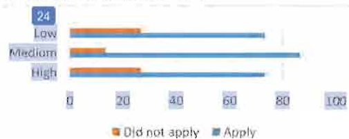
Figure 2 Teaching and Learning Process Based on National Examination Indexes

process. In conclusion, based on national examination indexes, all schools had implemented the K-13 in the teaching and learning process. However, schools with medium national exam index had high percentages compared to schools with low and high national examination indexes.