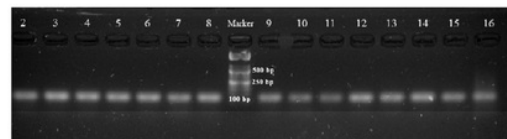
Figure 1. Results of Mx Gene Amplification in Chicken DNA Samples Showing 100 bp PCR Products

All chicken DNA samples generated 100 bp PCR products, as illustrated in Figure 1. Several study results indicate that the Mx gene is a potential genetic marker [20-23,25-27]. According to Seyama et al. [20], NE primers are widely used in Mx gene identification studies in chickens and waterfowl. Moreover, the PCR-RFLP method can be used to determine the Mx gene polymorphism in chickens [20,21,23,26,28]. The polymorphism of G/A at position 2032 of the chicken Mx gene resulted in a possible Mx protein at amino acid number 631 from serine (S) to Asparagine (N). In fact, one non-synonym mutation (S631N) is reported to be associated with antiviral capability against avian influenza virus infection in vitro [21]. The amino acid asparagine at number 631 indicates avian influenza virus resistance in chickens; whereas, the amino acid serine at number 631 indicates virus susceptibility in chickens. The S631N mutation can be detected using PCR-RFLP [20,21,23,26,28]. The PCR-RFLP method can also identify Mx gene polymorphism in pigs due to VSV infection [29]. Mx gene fragments were cut with RsaI enzyme at 5'GT AC3' to determine the Mx gene polymorphism characteristic [21,22]. With PCR-RFLP, three variations of different genotypes of Mx gene were