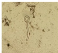
Figure 2. Observation of abdominal termites infected with EPN

In the previous study, (Widiyaningrum et al. , 2017) found that LD50 value the 24 hours pathogenicity test had not reached 50% mortality, but within 48 h termites mortality reached over 50%. According to (Widiyaningrum et al. , 2016), when the number of IJs entering the host's body exceeded the optimal limit, competition appeared and occurred between IJs and affected in reducing the mean number of migrating larvae from an insect.