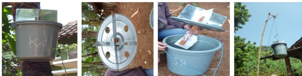
Figure 1. O. rhinoceros beetle trap device contains the aggregation pheromone

The aggregation pheromone used is made by the Medan Palm Oil Research Center/Pusat Penelitian Kelapa Sawit (PPKS) Medan. It contains Ethyl 4 methyl octanoate compounds. This compound is an aggregation pheromone that attracts both male and female O. rhinoceros . Liquid pheromones were packaged in porous plastic packaging which can efficiently be used for approximately three months. Pheromones were placed in 10 L bucket traps with 35 cm in diameter and 40 cm high (Figure 1). Pheromones are hung inside the bucket. In the bottom of the bucket, there was sawdust and a hole for water discharge when it rains. The top of the bucket was covered with a hole with 5 cm in diameter for the entry of the beetle into the bucket. Rectangular zinc was placed at the top of the bucket to direct the beetles that come in to get into the bucket through the hole.