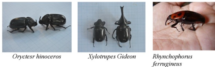
Figure 3. The picture of insects that have been captured by the traps ( O. rhinoceros , X.gideon and R. ferrugineus )

This aggregation pheromone is quite effective because it can capture more female insects (61%) than males (39%) with the ratio of 1.56: 1. Therefore, the use pheromones are not only for the monitoring purpose but also for controlling the beetles. After being caught the O. rhinoceros beetles were being killed with alcohol.